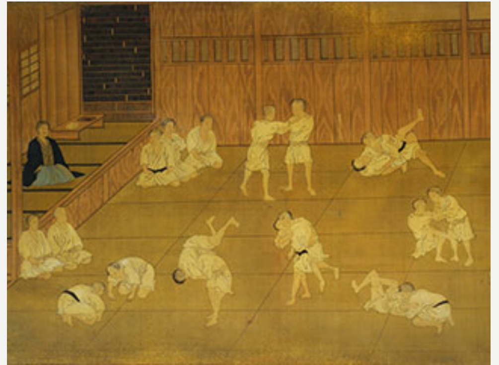
Kodokan that was located at Fujimi-cho