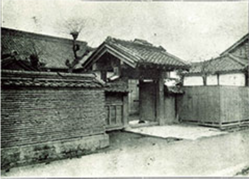
Eisho-ji Temple(Judo started here)