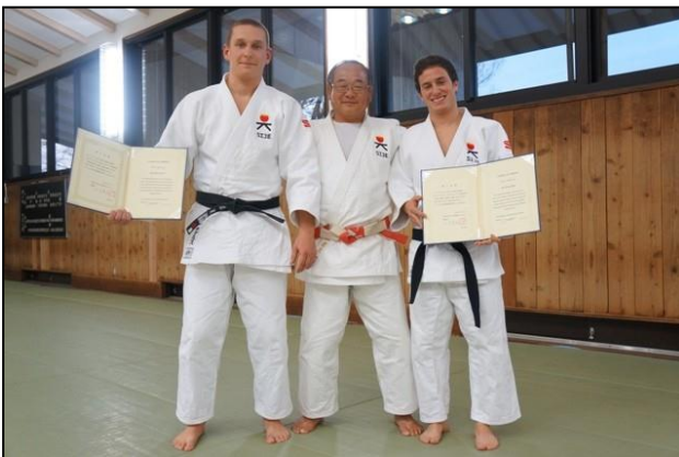
Accepting foreign instructors and students