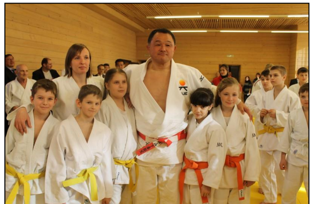
Dispatching instructors and students