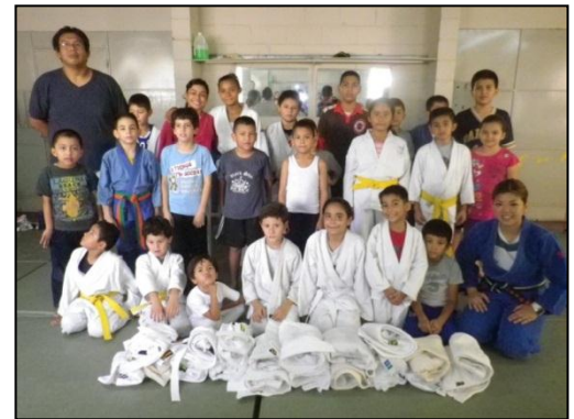
Donating recycled Judogi and Tatami mats