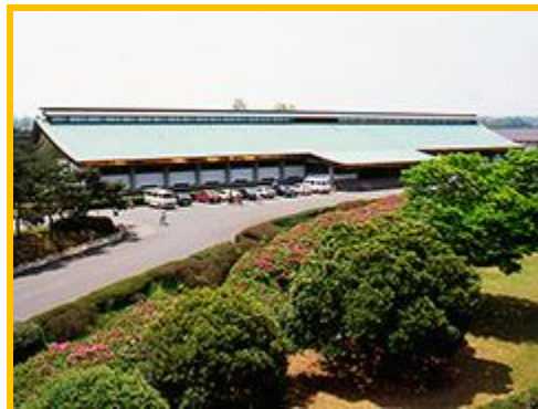
Tokai Univ. main campus